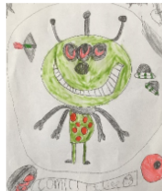
Year 1 and 2 winner – Orin (Peacocks)