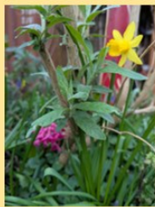
Hyacinths and Daffodils