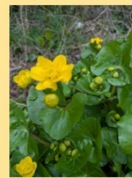
Kingcups or Marsh Marigolds

From 'The Garden Year' by Sara Coleridge