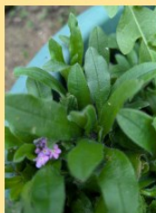
Forget-me-nots (These ones are pink, but many are blue.)

Here are some flowers that are already blooming in the garden. See if you can see them when you are out and about.