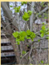
New hawthorn leaves